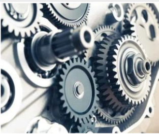
Machine Components such as Gears and Shafts