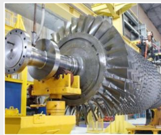
Heavy Engineering and Industrial Applications